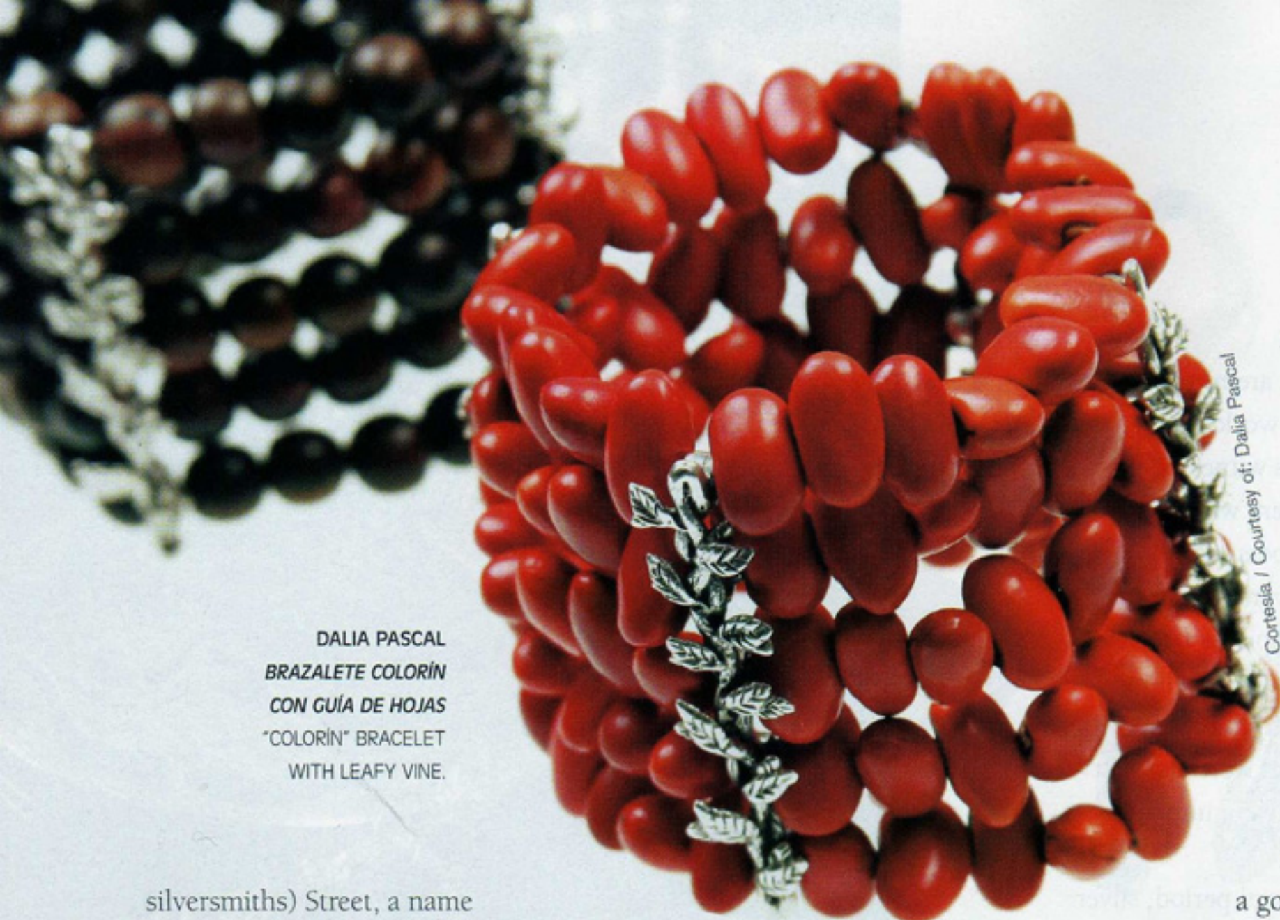
DALIA PASCAL BRAZALETE COLORÍN CON GUÍA DE HOJAS "COLORÍN" BRACELET WITH LEAFY VINE.